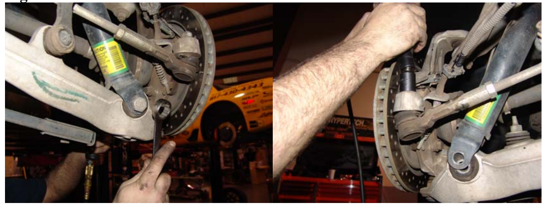
Figure 7a and 7b Removal of lower shock bolt and tie rod.

This next section will differ slightly between C5 and C6 cars. On C5 cars you will start by removing the leaf spring mounts from the car, then the outer bolts holding the spring to the control arms. On C6 Corvette's you will have to separate the lower control arm from the upright just as you did at the front of the car then remove the spring mounts from the K member. Remember to remove the mount on the side that you separated the control arm from first, it will have the least amount of load on the spring.