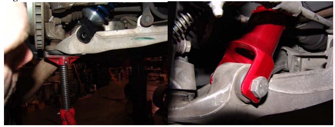
Figure 14a and 14b: Install of rear coil over

Finish the install by installing sway bar end links, and making sure all mounts, nuts, bolts, are tight. Also make sure that all wires, and fluid lines are clear of the springs and shocks so that they are not pinched.