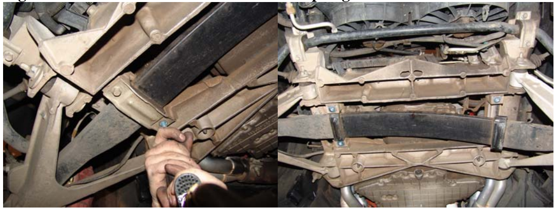
Figure 6a and 6b Removal of the front leaf spring

Start by removing the driver side first as this has the control arm removed and will take the remainder of the pressure off of the spring. Move to the passenger side and pull the spring from the car.