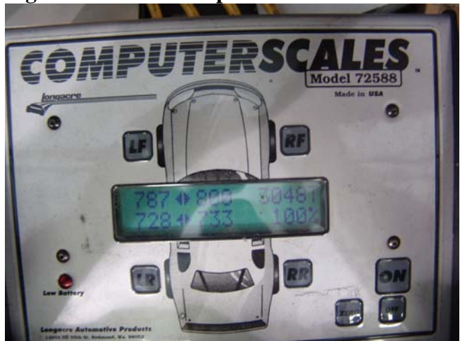
Figure 15: Scale example

Keep in mind, you can not change front, rear, or side percentage without physically moving, adding, or removing weight. The cross can be adjusted by changing the spring adjusters on the shocks. This change will make sure the car handles the same at the limit on both right and left hand corners.