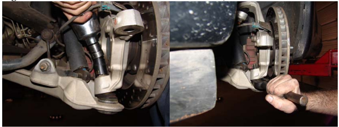
Figure 3a and 3b (removal of lower control arm nut)

You will only be removing one lower control arm and upright, one on the front and one on the rear. You may now also remove the shock from the passenger side of the car. Make sure that all rubber shock mounts have been removed from the chassis side of the car as well at this time, these will not be needed.