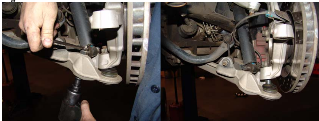
Figure 5 Separation of the front lower control arm

Figures 4a and 4b Removal of lower front shock mount