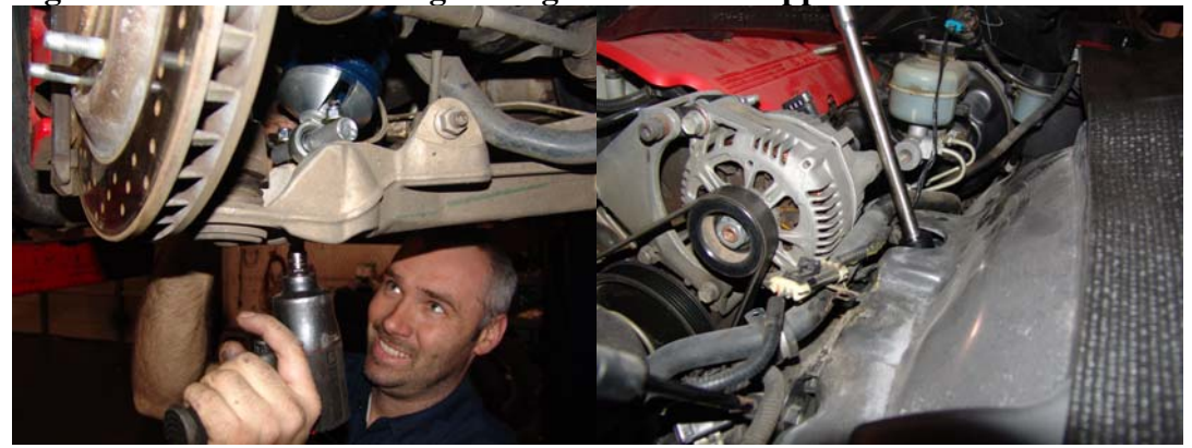
Figure 12a and 12b: Final tightening of lower and upper mounts

Once both coil overs are installed, tighten the upper shock mount at the frame. The shock will want to turn while doing this, make sure that the bolt holding the shock in place is parallel to the frame once it is tight and not at an angle.