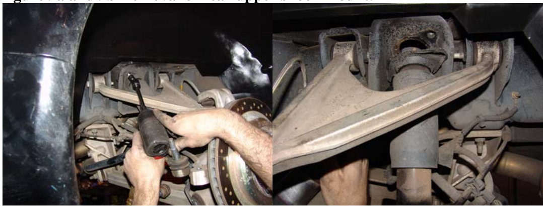
Figure 9a and 9b Removal of rear upper shock mount.

Pull the shock free, and clean off any debris that might be on the frame. We have now completely removed the shock and spring system from the car and are ready to install our new LG coil over suspension package.