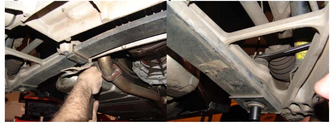
Figure 8a and 8b Removal of rear leaf spring (C5 shown)

Now that the spring has been removed, take the upper shock mounts loose from the car and remove the rear shocks. This is done by removing the two 10mm bolts holding the upper shock mount plate to the frame of the car.